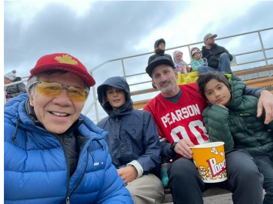
Friday Football Family Night!!!